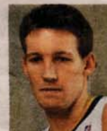
Dunleavy Table 42