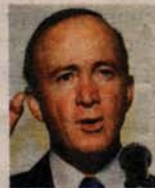
Daniels Table 102