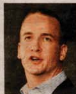
Manning Table 52