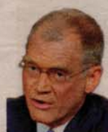
Letterman Bar area