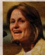
Kennedy Table 52