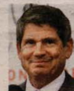
Smulyan Table 112, outdoors